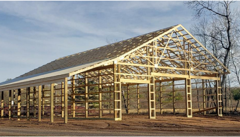
Donations and volunteers have been essential in completing our new maintenance building.

There is still a lot to do, especially with 20+ year buildings and systems. We continue to work with skilled volunteers to help complete many projects around campus. Thank you volunteers!